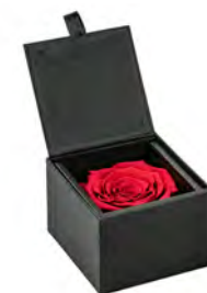
GB1 size giftbox (cm) 8,5x6x8

single pack 3 heads units per master box 60 x 3 sizes master box (cm) 48x47x54 dna for Rainbows, Flags