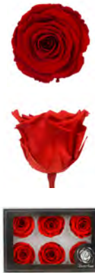
SINGLE ROSE L diameter 5cm height 4,5cm

single pack 12 heads units per master box 60 x 12 sizes master box (cm) 53x47x33 only available in Pin04, Red02 and Whi01