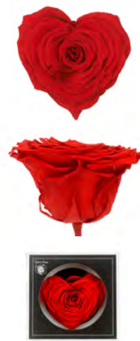
SINGLE ROSE CORAZON diameter 9cm height 5,5cm

single pack 1 head units per master box 100 x 1 sizes master box (cm) 72x59x48 dna for Bicolors, Metallic Tints, Rainbow