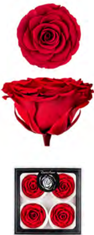
SINGLE ROSE BELLA diameter 7,5cm height 4,5cm

single pack 4 heads units per master box 60 x 4 sizes master box (cm) 81x57x42