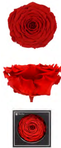
SINGLE ROSE XXL diameter 9,5cm height 5,5cm

single pack 1 head units per master box 100 x 1 sizes master box (cm) 72x59x48