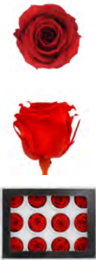
SINGLE ROSE WARMI diameter 3,5cm height 3cm

single pack 18 heads units per master box 60 x 18 sizes master box (cm) 81x44x40 only available in Pin04, Red02 and Whi01