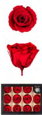
SINGLE ROSE M diameter 3,7cm height 3,3cm

single pack 12 heads units per master box 60 x 12 sizes master box (cm) 81x44x40 dna for Bicolors