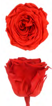
GARDEN ROSE CAMILA diameter 6,5cm height 5,5cm

single pack 12 heads units per master box 60 x 12 sizes master box (cm) 81x44x40 dna for Rainbows, Flags