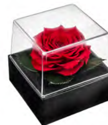
GB3 size giftbox (cm) 11x11x10

single pack 1 units per master box 82 x 1 sizes master box (cm) 111x25x27