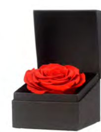
GB7 size giftbox (cm) 9,5x9,5x9

single pack 1 units per master box 66 x 1 sizes master box (cm) 111x25x27