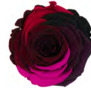
PIN 02 DARK