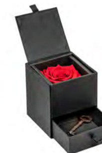
GBK size giftbox (cm) 9x10x9

single pack 1 units per master box 60 x 1 sizes master box (cm) 29x39x47,5