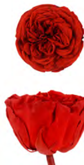
GARDEN ROSE KABUKYZA diameter 6cm height 4cm

single pack 6 heads units per master box 60 x 6 sizes master box (cm) 69x62x46 dna for Rainbows, Flags