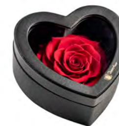
GB10 size giftbox (cm) 12,5x12,5x8,5

single pack 1 units per master box 60 x 1 sizes master box (cm) 53x39,5x42,4