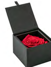
GB2 size giftbox (cm) 10,5x7,5x11

single pack 1 units per master box 100 x 1 sizes master box (cm) 45x36x34