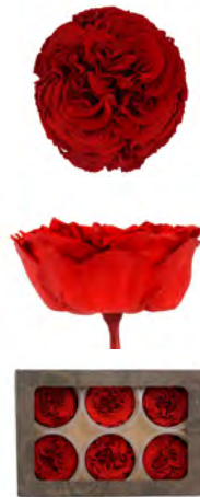
GARDEN ROSE CARMEN diameter 6cm height 4cm

single pack 6 heads units per master box 60 x 6 sizes master box (cm) 69x62x46