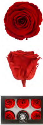
SINGLE ROSE LL+ diameter 6,5cm height 4,5cm

single pack 6 heads units per master box 60 x 6 sizes master box (cm) 74x44 x45