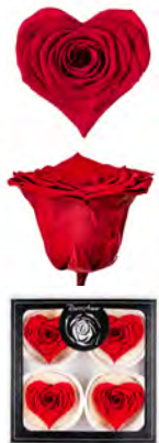
SINGLE ROSE BELLA CORAZON diameter 7cm height 5,5cm

single pack 6 heads units per master box 60 x 6 sizes master box (cm) 69x62x46