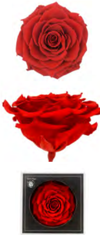
SINGLE ROSE BONITA diameter 9cm height 5,5cm

single pack 4 heads units per master box 60 x 4 sizes master box (cm) 81x57x42