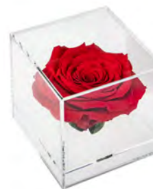
GB12 size giftbox (cm) 9x9x9

single pack 1 units per master box 60 x 1 sizes master box (cm) 42,5x38x39