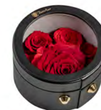
GB9 size giftbox (cm) 12,5x12,5x8,5

single pack 1 units per master box 48 x 1 sizes master box (cm) 76x49x27