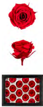
SINGLE ROSE XS diameter 3cm height 2cm

This section of the brochure shows you all different types, sizes, packaging and measurements. The products are available in all colors (including rainbow) and treatments as described in the brochure.