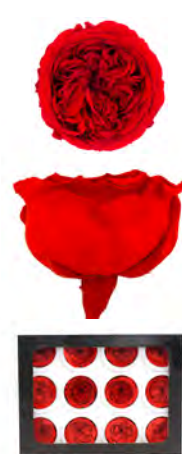
GARDEN ROSE AMELIA diameter 4cm height 2cm

single pack 1 stem units per master box 30 x 1 sizes master box (cm) 49x42x75