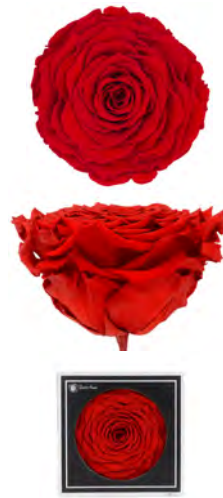
SINGLE ROSE WAYRA diameter 11,5cm height 7,5cm

single pack 1 head units per master box 100 x 1 sizes master box (cm) 72x59x48