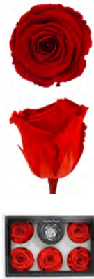
SINGLE ROSE XL diameter 6,5cm height 5,5cm

single pack 6 heads units per master box 60 x 6 sizes master box (cm) 78x50x47