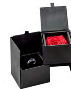
GBR size giftbox (cm) 9x12,5x9

single pack 1 units per master box 100 x 1 sizes master box (cm) 51x46x46