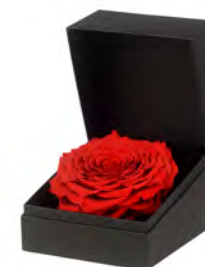
GB6 size giftbox (cm) 12,5x10x12,5

single pack 1 units per master box 100 x 1 sizes master box (cm) 58x35x35